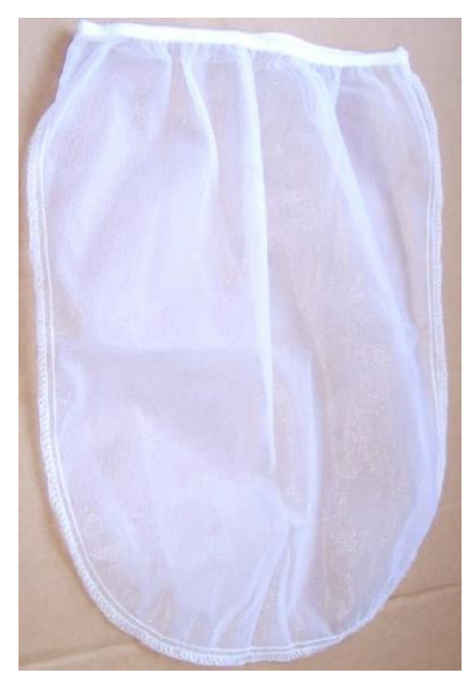
1 gallon paint strainers with rubber bands to tie the top