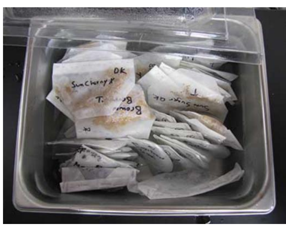
Stapled coffee filters