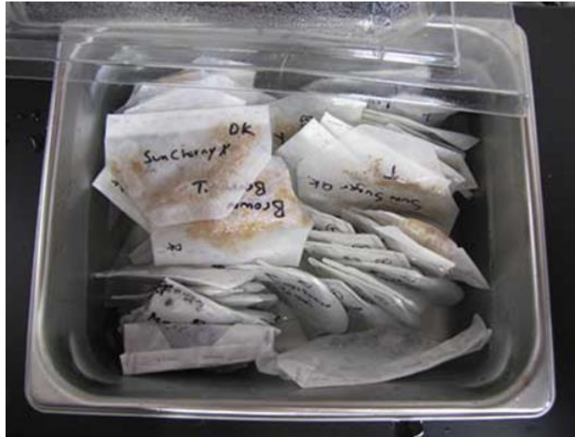
Stapled coffee filters